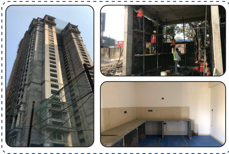
Hiranandani - Panvel