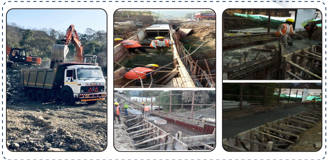
Godrej - Panvel